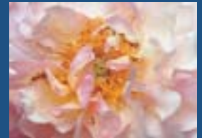
Character in Your Hands