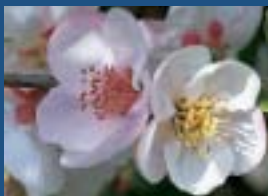
Chorus and Verse