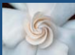
Reverence and Healing