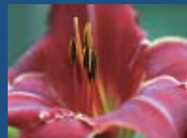
Depth and Pacing