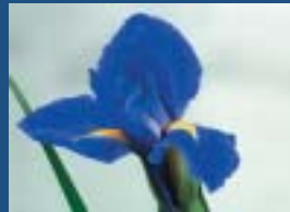
Beginning Middle and Ending