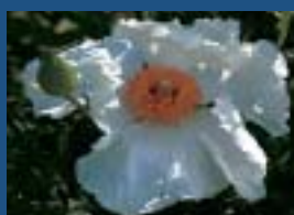
Surrender and Control