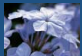
Safety and Comfort