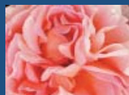
Rhythms and Transitions